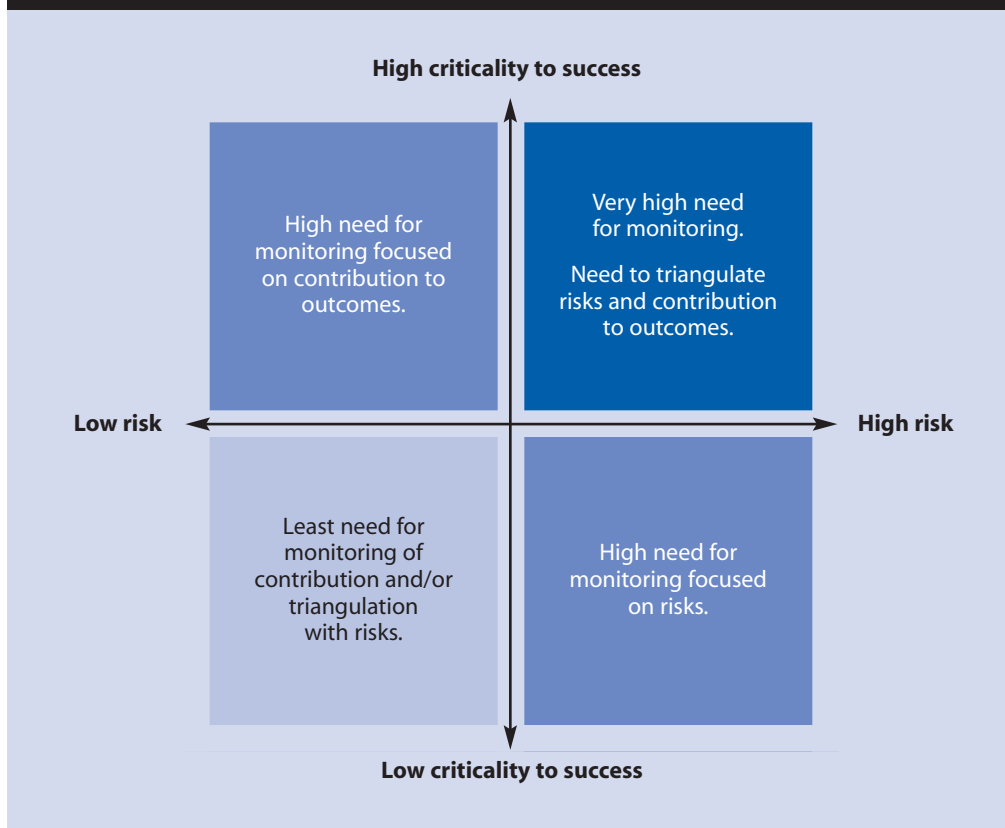
Figure 15. Prioritizing monitoring